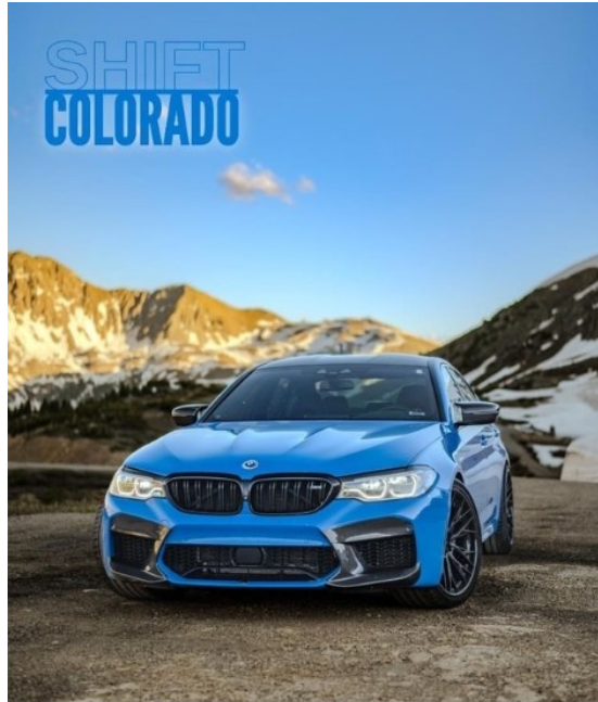
Issue 9 | Summer 2024

https://shiftcoloradomagazine.com/issue-9/