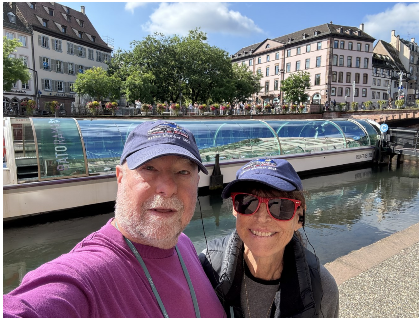
More time now for river cruises! This is in Ville de Strasbourg, France