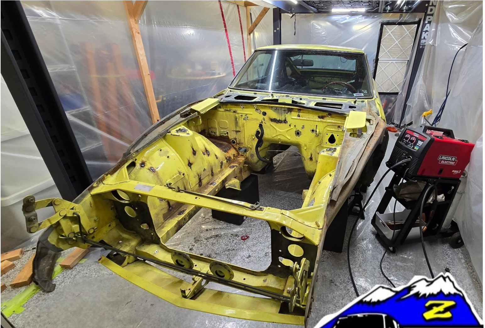
Post, send me your project stories and pictures